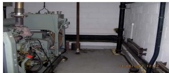
Llyn Brenig, North Wales, hydro generation scheme